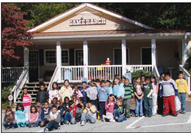
Rockbridge Elementary students enjoyed the game ranch on a sunny October afternoon

The Yellow River Game Ranch is located at 4525 Highway 78 in Lilburn. Additional information can be found on the website at www.yellowrivergameranch.com or by calling (770) 972-6643.