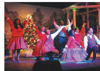
A Hometown Holiday Magnolia Theater

The Polar Express 4-D Experience Enjoy this classic film as a 4-D experience during the Holidays at Stone Mountain.